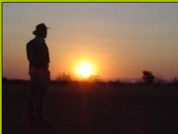
Experience the African sunset

Staff is extremely well trained and promises you a hunting experience to treasure forever.